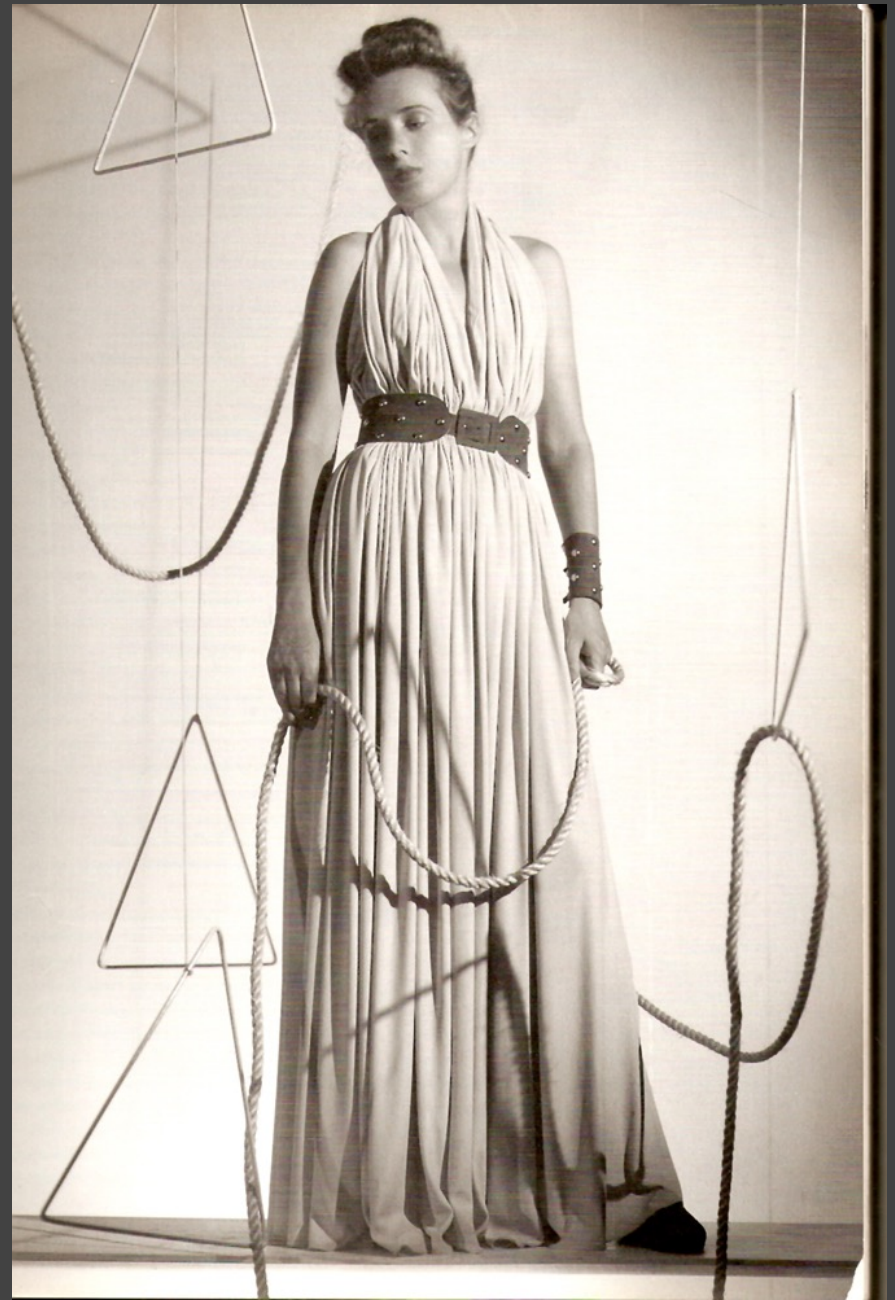
Claire McCardell c. 1939