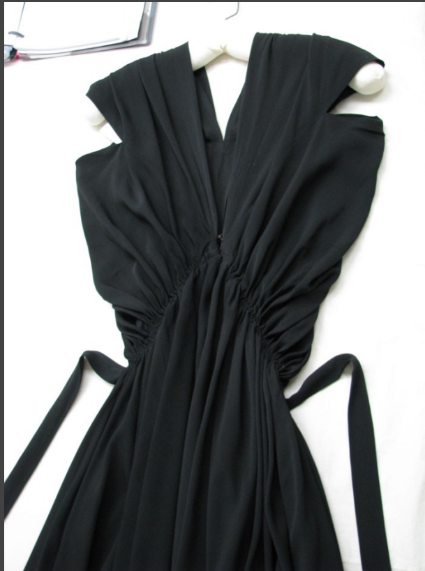
Flat on table